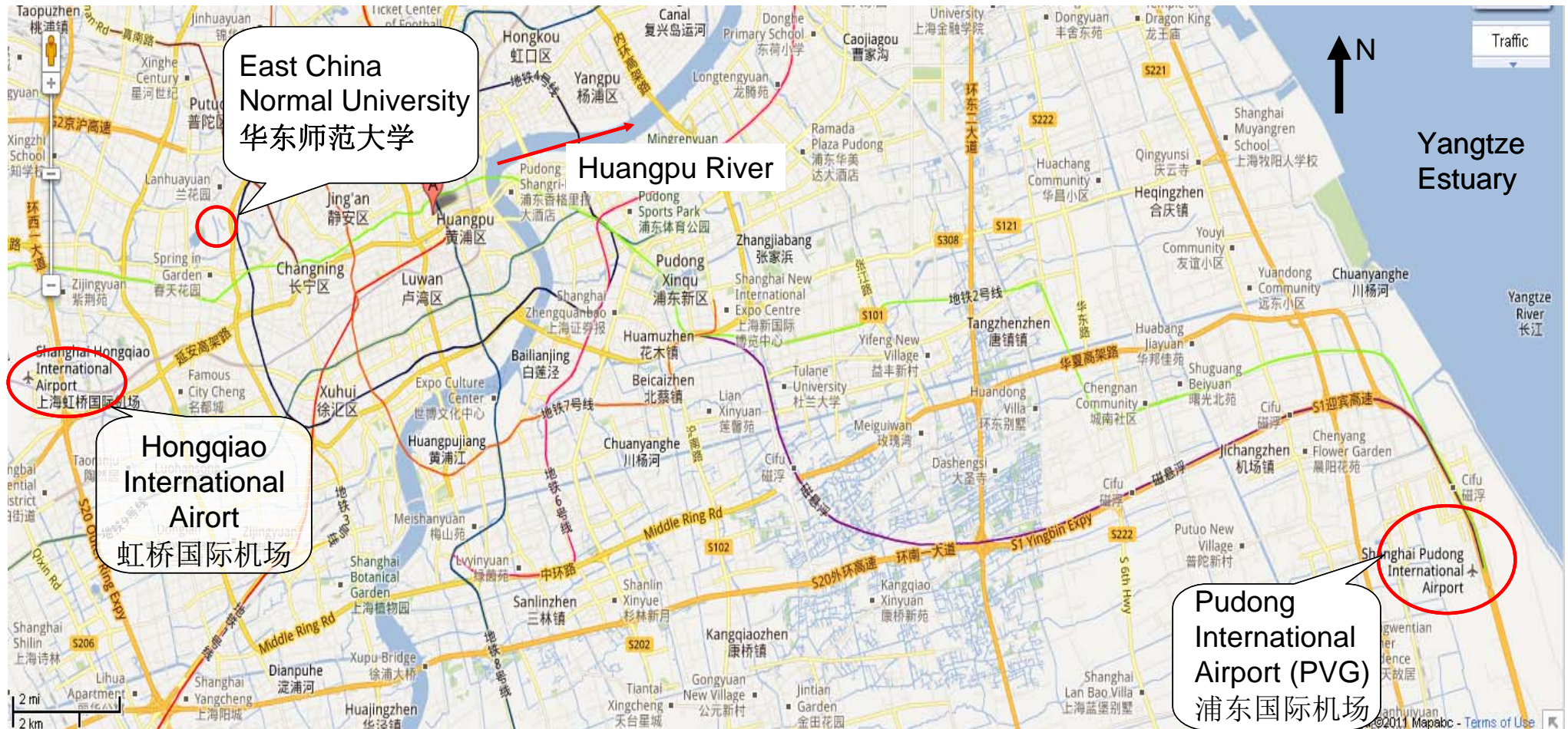
Map 1: Shanghai, Location of the Hongqiao (SHA) and Pudong International Airport (PVG) and the campus of East China Normal University (ECNU)